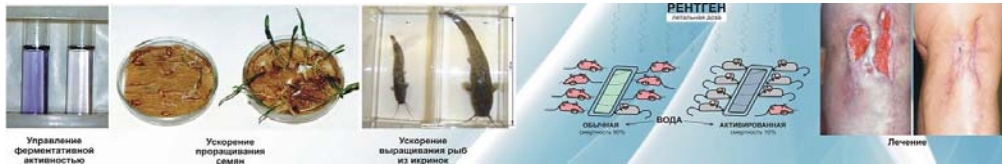
Influence of activated mediums on biosystems

Project mission: Obtaining biologically active condensed mediums (disinfecting, sterilizing & washing solutions, substance, and bio-products); selection of new sorts of plants, animals, birds and fish; cleaning and disinfection (particularly, for water pipes, premises); pH adjustment of soil; increasing the volume of harvest and the weight of young animals; prevention, treatment of diseases and protection against them.